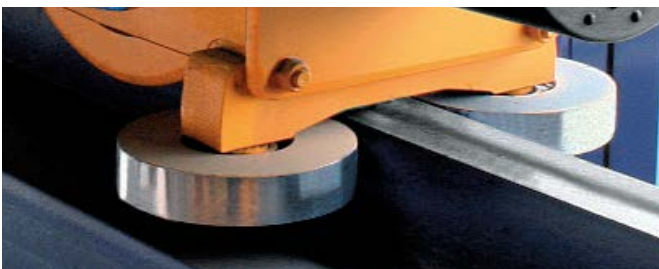
Guide rollers on the high level crane rail