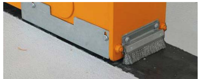
Floor rollers without guide rails